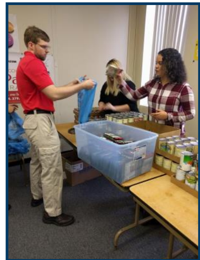
Left: Blue Ridge CTC students and staff packing food for local schools in need.