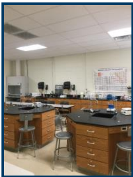
The laboratory for our Applied Lab Technician Program

Olay Body Wash, a product made by P&G, is clinically proven to slow the skin aging process. It does so through its top five ingredients: retinyl propionate (vitamin A derivative), glycerin, niacinamide (vitamin B3), broad spectrum sunscreen, and amino peptides. Retinyl Propionate is considered the go-to ingredient for reducing the appearance of lines and wrinkles as well as for preserving collagen. Glycerin hydrates lines and wrinkles. Niacinamide reduces the appearance of lines and wrinkles by increasing skin cell renewal as well as helps to strengthen the skin's moisture barrier. Broad Spectrum Sunscreen helps prevent UV skin damage that results in lines and wrinkles.