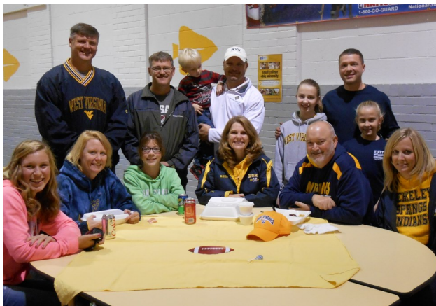
Tailgate Celebration attendees gather for a small group snapshot.

The Blue Ridge Community and Technical College Foundation hosted the second annual Tailgate Celebration at Berkeley Springs High School (BSHS) to raise funds for the Morgan County Early College high school program. The event was Friday, October 10 at 5-7pm and offered a tailgate dinner made by the Blue Ridge CTC Culinary Academy chefs and students. BSHS administration, faculty, staff, students, and community members were invited to attend; adult tickets were $10 and students were $5. The event brought in $1,563.00 with several sponsors supporting the event. Bradley, Thomas & Matthew Close, CPAs, PLLC were the Junior Varsity Sponsor; and Arndt McBee Insurance, City National Bank, Close Insurance, and Gat Creek were Freshmen sponsors. Proceeds of the event benefit the Blue Ridge CTC Foundation's Morgan County Early College Fund. The funds are used to purchase textbooks for Morgan County students in the Early College High School program. Currently, Blue Ridge CTC provides college classes for high school students in Morgan County. Classes to be offered include, but are not limited to, English, Mathematics, and Mechatronics.